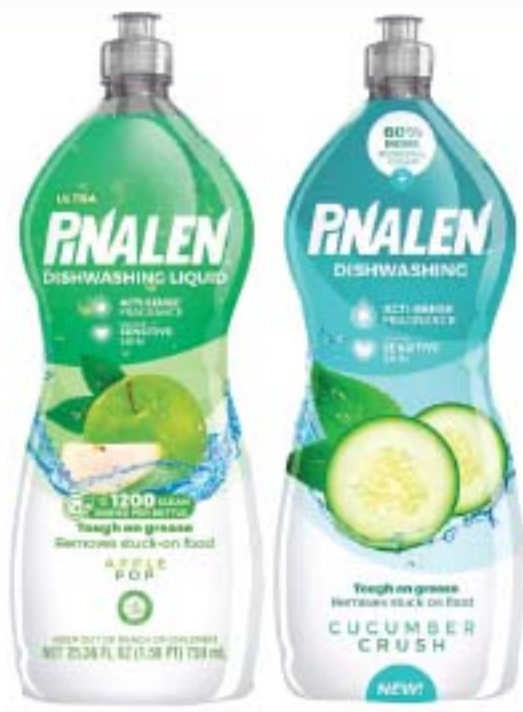
Pinalen Dish Liquid 25.3 oz.