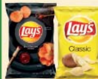
Lay's Potato Chips 4.75-8 oz.