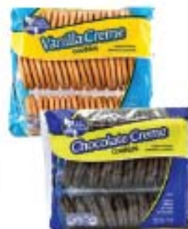
Lil Dutch Maid Creme Cookies 11.8 oz.