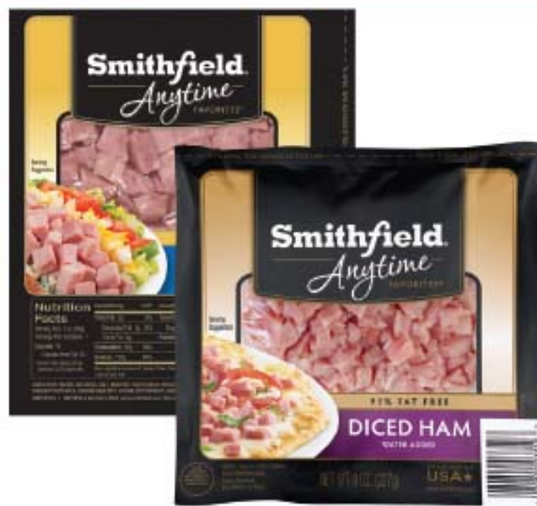
Smithfield Diced or Cubed Ham 8 oz.