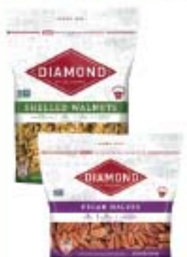
Diamond Shelled Walnuts, 32 oz. or Pecan Halves, 16 oz.