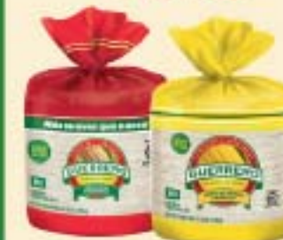
Guerrero Corn Tortillas 80 count, white or yellow