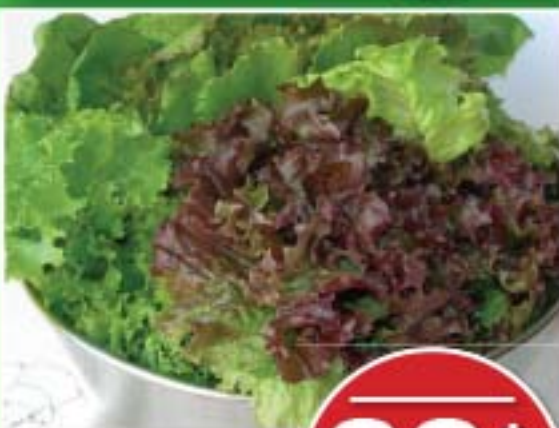
Romain, Green or Red Leaf Lettuce