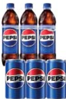
Pepsi 6 pack, 7.5 oz. or Pepsi 6 pack, 16.9 oz.