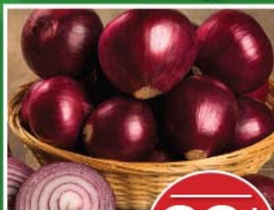
Jumbo Red Onions