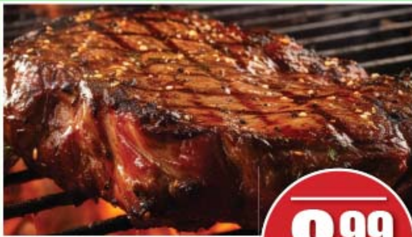
Boneless Ribeye Steaks Family Pack, IGA Beef