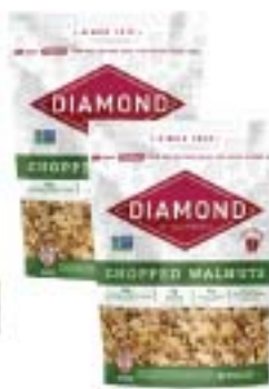
Diamond Chopped Walnuts 8 oz.