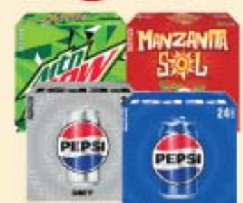
Pepsi 24 Pack, 12 oz.