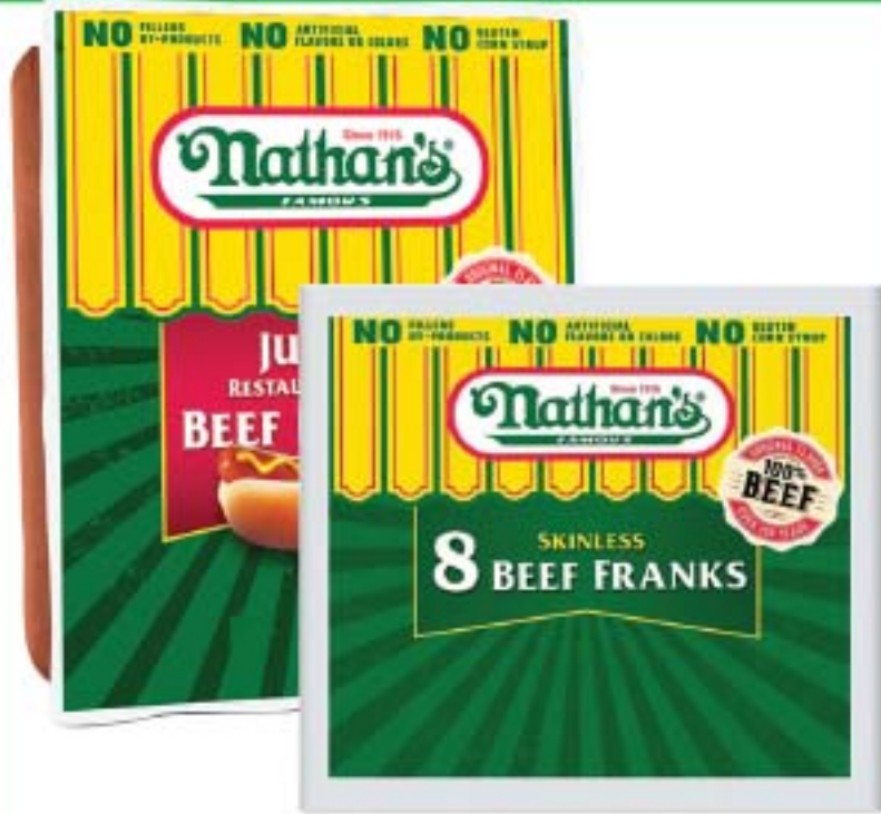
Nathan's Franks 11-12 oz.