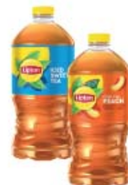
Lipton Tea 64 oz.