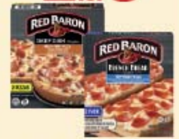
Red Baron Pizza assorted