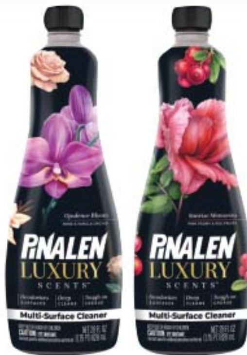
Pinalen Luxury Scent Cleaner 22-28 oz.