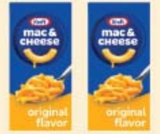
Kraft Mac & Cheese 7.25 oz.