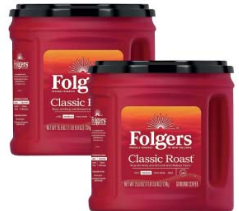
Folgers Coffee 22.6-25.9 oz.