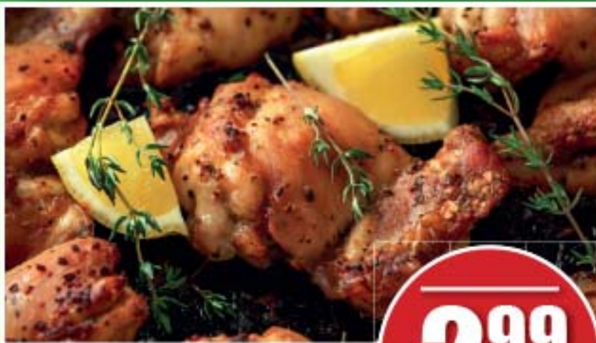
Boneless Skinless Chicken Thighs Family Pack