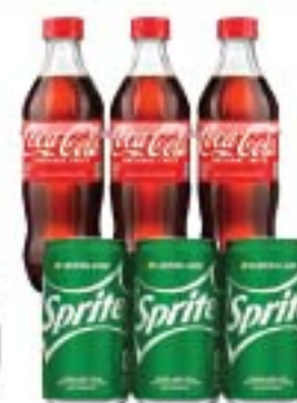
Coca-Cola 6 pack, .5 liter or 6 pack, 7.5 oz.