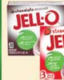
Jell-O Pudding or Gelatin 3-3.9 oz.