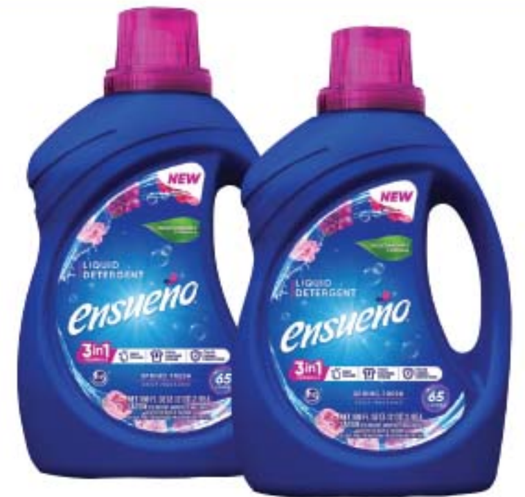
Ensueno Laundry Detergent 100 oz.