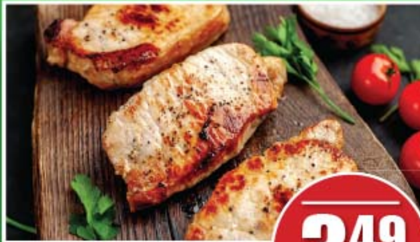
Boneless Pork Chops Regular, Thin or Midwest Sirloin Cuts