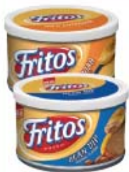
Fritos Bean or Cheese Dip 9 oz.