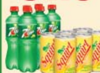
Squirt or 7-Up 6 pack, .5 liter or Squirt or 7-Up 6 pack, 7.5 oz.