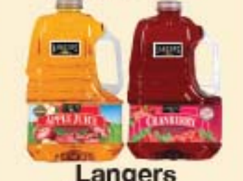
Langers Apple Juice Cranberry Cocktail 3 liter